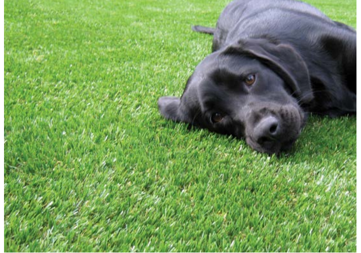
Studies show Coolplus surface temperatures are consistently up to 25% lower/ cooler than standard or generic yarns.

Our COOLplus technology also creates more of a matte finish to the synthetic fibres, reducing the often shiny appearance of artificial grass. Our premium surfaces are also softer to touch and less abrasive than other artificial grasses.